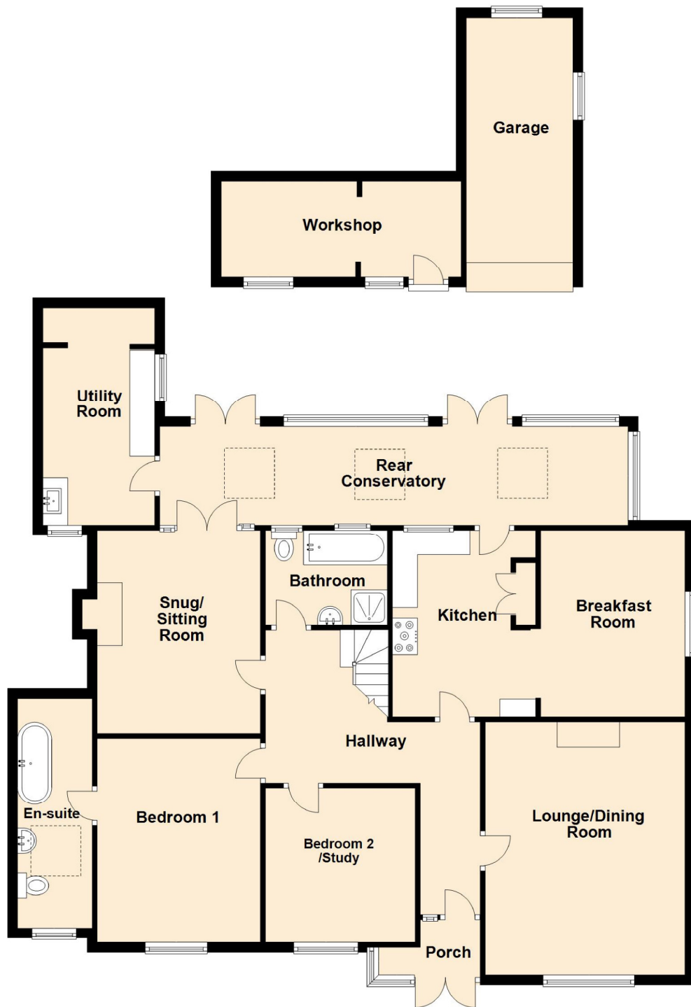
Ground Floor Approx. 158.1 sq. metres (1701.4 sq. feet)